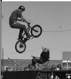
BMX SHOW IN NOVEMBER!!